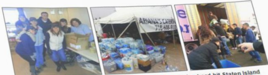
R.E.M.'s "UNITE-HELP-GIVE" disaster relief initiative helps hard-hit Staten Island